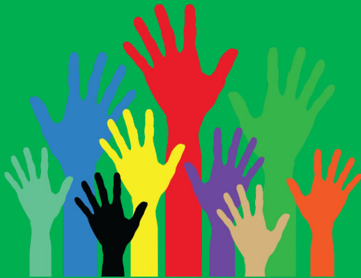
Accessible for All