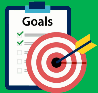
Feedback & Goal Setting