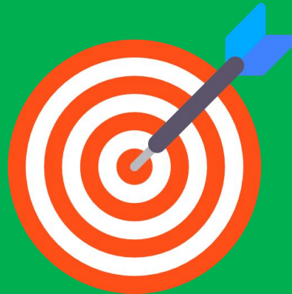
Targeted Instruction (RTI)